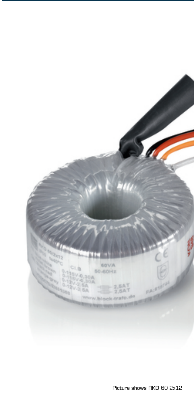
Picture shows RKD 60 2x12